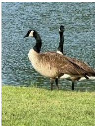
MLGG & SOF

5:30 PM GANDERS & GOSLINGS & GUESTS NEW YEAR KICKOFF EVENT – RESERVATION'S REQUIRED SECOND MONDAY, JANUARY 13, 2025 MEETING: TBD