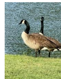
GOP & COP