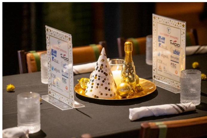
GREAT DÉCOR – BEAUTIFUL ROOM

Mexican Sugar; 7501 Lone Star Drive; Plano, TX 75024