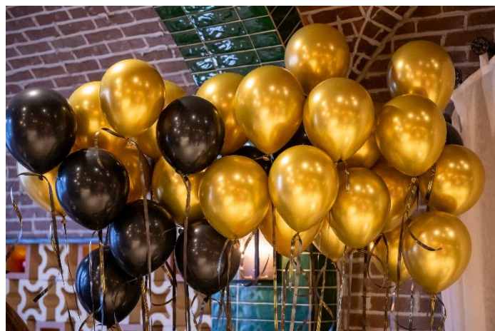
BALLOON POP & FOOTBALL SQUARE BOARDS (COLLEGE NATIONAL CHAMPIONSHIP & SUPER BOWL)