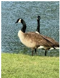
MLGG & SOF

THE 2024-2025 BLUE GOOSE COMES TO END. OUR NEXT BLUE GOOSE YEAR STARTS ON JULY 1 ST .